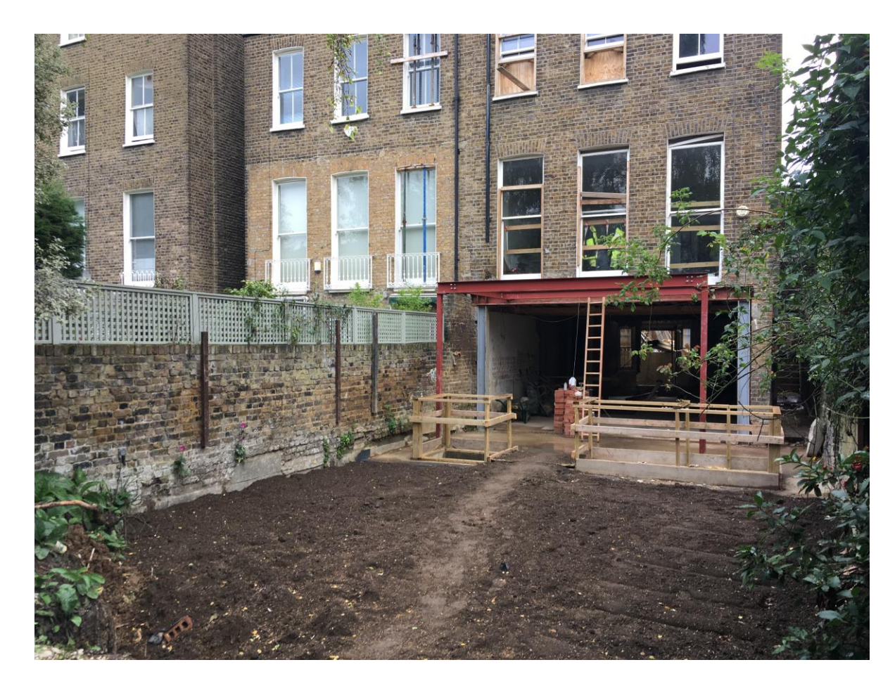
View of partially completed rear extension.